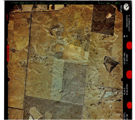
1997 aerial photo of Mali Dunes showing Bushland Reserve top right and private remnant below.